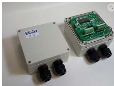
Figure 2. Connect to Data Logger