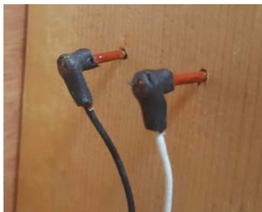
Figure 1. Space nails 1cm to 2cm apart and lightly hammer into material to be tested.