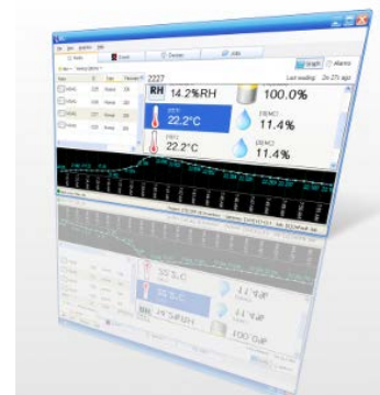
Figure 3. Dataloggers transmit data to BiG and/or TiG and sync with Analytics